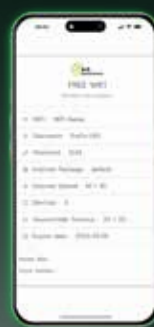
Guest Wi-Fi Coupon

Create a branded Wi-Fi experience with AIS Hotel Wi-Fi .